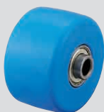
MC nylon wheel (including B)