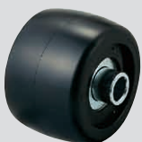
Reinforced nylon wheel (including B)

Refer to P165 for detailed specifications.