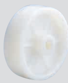
N Nylon wheel