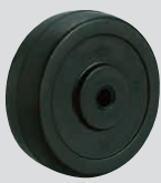
R Rubber wheel

Refer to P157 for detailed specifications.