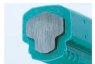
T Type Grip