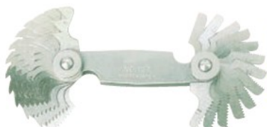
137 (for Inch)

For inch Specs • Precision: 60 to 40 threads (±0.03mm)/39 to 10 threads (±0.05mm)/9 to 4 threads (±0.07mm)