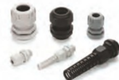
Cable gland See page 333 ~ 340