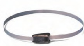
Pole mounting belt PKB-10 series See page 324