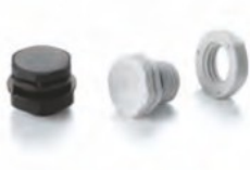
Protective vent PMF series See page 325 ~ 326