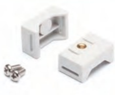
Pole mount bracket WPMB series See page 21