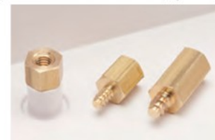
Tapping standoff TPS series See page 122