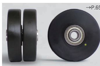
MCD (Conductive monomer cast nylon/Black)