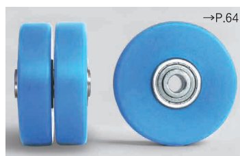
MC (Monomer cast nylon/Blue)

See P.62 to P.71 for detailed description.