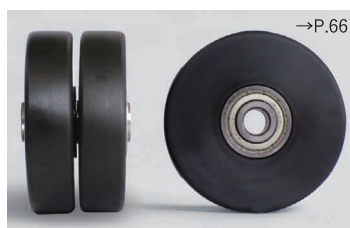
MCMO (Monomer cast nylon/Black)