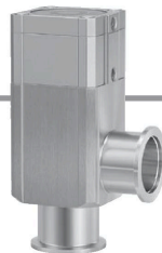
XLC16 to 40