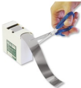
Can be cut to necessary size