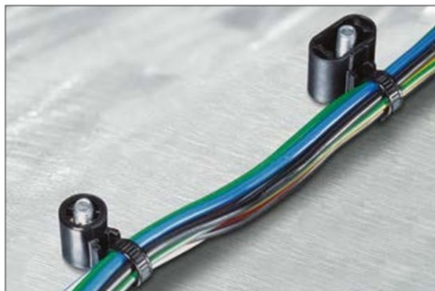
This outside serrated tie with weld stud mounting keeps the cables close to the fixing stud.