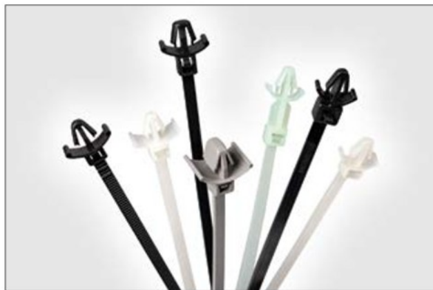
A wide range of arrowhead fixing ties which are suitable for different panel thicknesses and hole diameters.