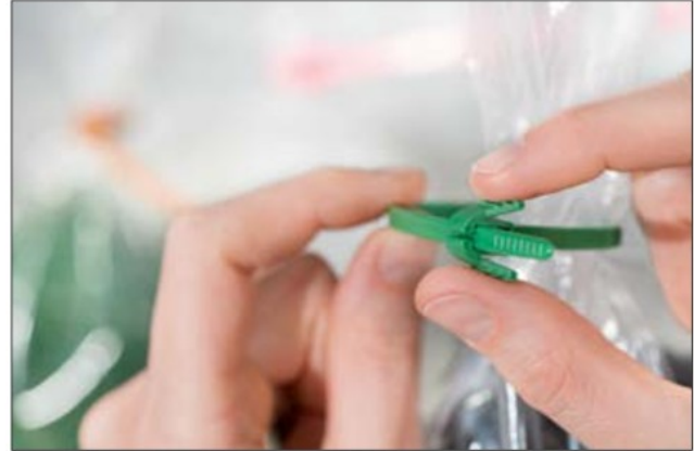
The inside serrated REZ ties have a one-hand, simple release mechanism.