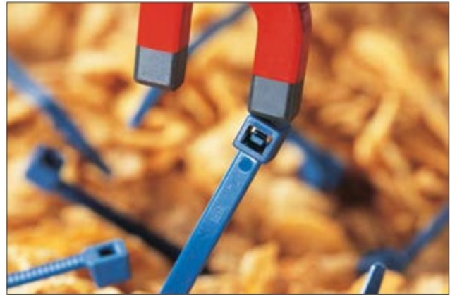
Our detectable MCT(S) cable ties are used in the food and pharmaceutical industry.