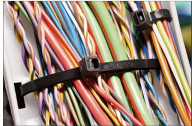
Standard T-Series cable ties – for almost any type of application.