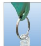
with strap hole