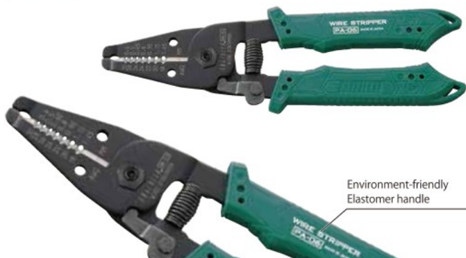
Environment-friendly Elastomer handle