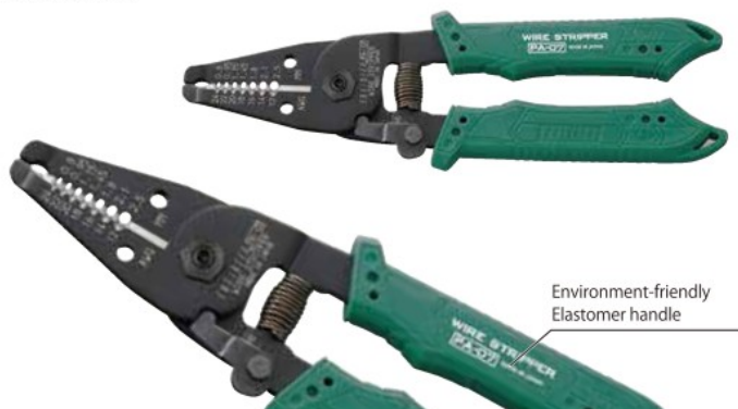
Environment-friendly Elastomer handle