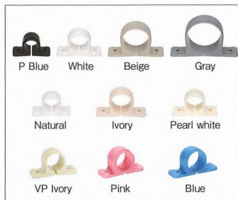
Part number A10511 Polypropylene saddle