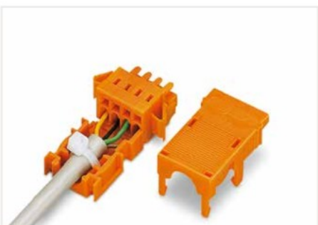
4-pole; 1-conductor female connector; with locking levers and strain relief housing (2- to 5-pole strain relief housing suitable only for cable ties)