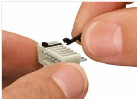
Coding a male header via snap-on coding keys.