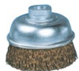
GCB-90 (brass plating steel wire)