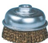
GCB-125 (brass plating steel wire)