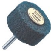
UFN425-600 (outer diameter 40mm)