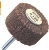
UFN425-120 (outer diameter 40mm)