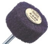
UFN425-240 (outer diameter 40mm)