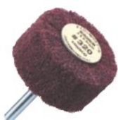
UFN425-320 (outer diameter 40mm)