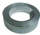
METS3-X (tape for stamp)