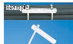
Panduit Corp. Japan Branch