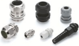
Cable gland See cable gland pages