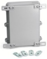
Mounting bracket HQF series See page HQ-7