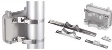
Pole mounting bracket SSK series See page SSK-M-1 ~ SSK-M-3