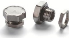
Protective vent PMF series See PMF pages