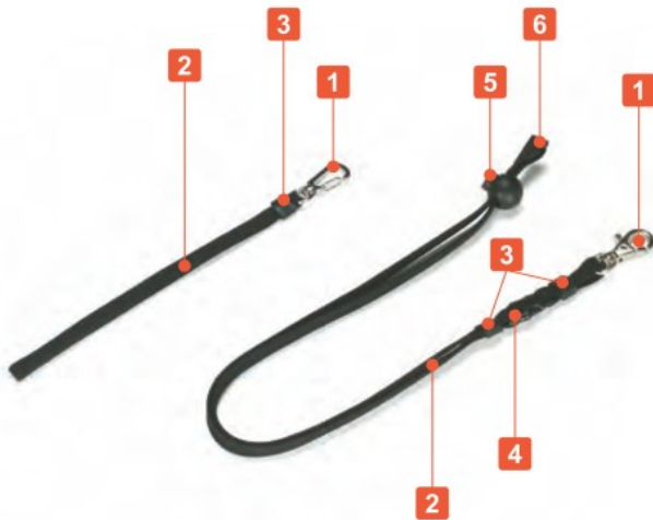
Wrist strap (STP-200)