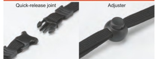
Neck strap detail