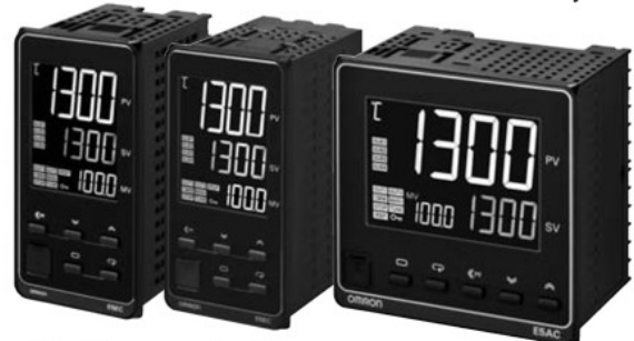
48 × 96 mm Screw Terminal Blocks E5EC