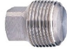
Fig : PP

1/8-4inch(6-100mm), Conform to : RoHS 6-100 mm (1/8-4 inch), ,KITZ