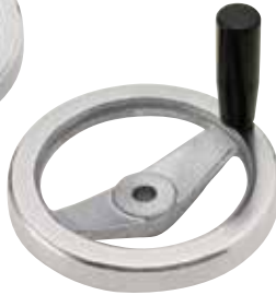
AL2SP (With Handle-Mounting Tapped Hole) Note: Handle must be ordered separately