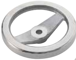
AL2SP-N (Without Handle-Mounting Tapped Hole)