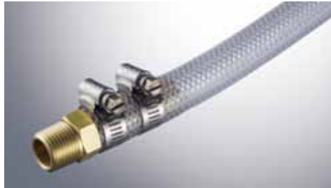
EIGHTNIPPLE S/B Size Image

The area for tightening with hose clamps is large due to the flat 2-stage structure. Thus, you can fix firmly.