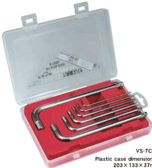
VS-7C Plastic case dimensions : 203 × 133 × 37mm