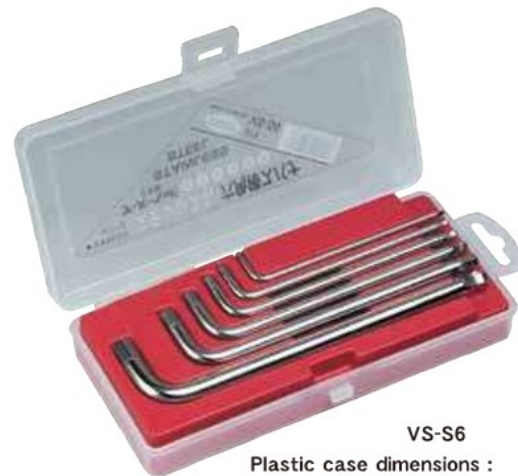
VS-S6 Plastic case dimensions : 188 × 88 × 35mm